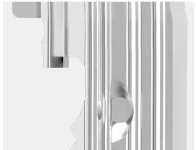
The Vitess locking system features the patented Intop system* in both the cylinder and the key to provide effective protection against illegal key copies and manipulation of the lock cylinder.