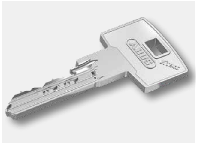
The high-quality, stable key is made from low-wear nickel silver to ensure long-term security. The unique shape makes the key extraordinarily stable.