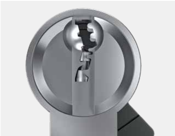
The curved profile provides protection against intelligent opening methods.