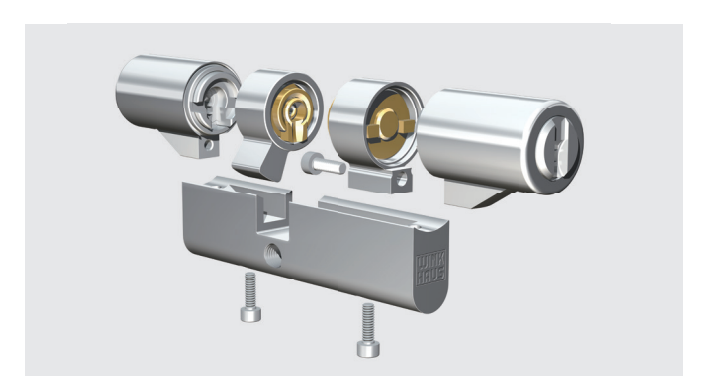
The keyTec X-tra cylinder's modular design ensures it can be adjusted as required to fit different door thicknesses.

keyTec X-tra is the ideal system for both individually-secured cylinders and locking systems in all building types, from single family homes through to office buildings with complex locking hierarchies. Keyed-alike cylinders can also be easily provided with a special, exclusive customer profile.